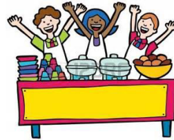
Table of Grace Meals will be held on April 22 nd . They will be serving Roast pork, potatoes, applesauce, vegetable and dessert.