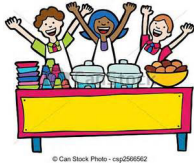
Table of Grace Free Meal: Will be held on Friday, Feb. 26th from 5:30- 6:30pm at the Vergennes Congregational Church. All are welcome and bring a friend. They will be serving: Chicken ‘n biscuits, stuffing, vegetable, cranberry sauce and dessert.

St. Peter’s Fish Fry Hosted by the K of C: Mark your calendar for Feb. 26 th . Serving from 5 to 7:00pm at St. Peter’s Parish Hall. Come join us for Battered Baked Haddock, fries, macaroni & cheese, green beans, coleslaw, rolls, punch, milk, coffee. Adults - $11, Children under 12- $6 Immediate family (only) $32. Please bring a dessert to share. For more information please call 877-2367.